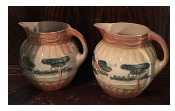
One example of an auction item, see our website for more pictures.

It will have something of interest for everyone-handmade items, gift baskets and gift certificates from local merchants and restaurants, vases, jewelry, antiques and more!