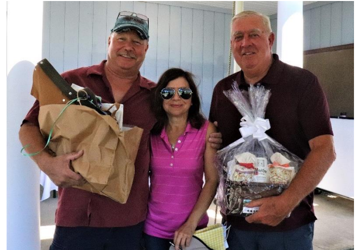
A Silent Auction was part of the fun as well, along with top teams and players awards.